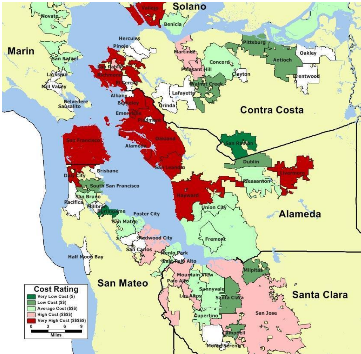
Figure 2. Descriptive Map of San Francisco Bay Area Cost Ratings for 2012